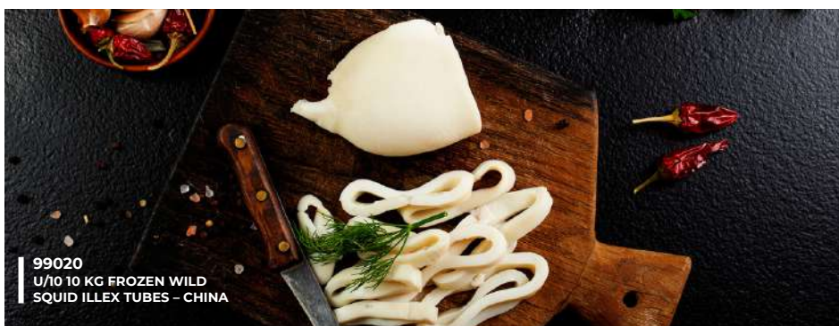
99020 U/10 10 KG FROZEN WILD SQUID ILLEX TUBES – CHINA