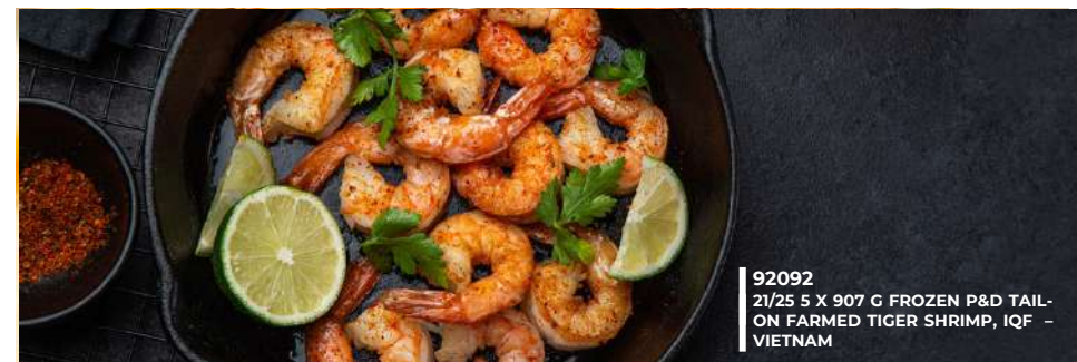
92092 21/25 5 X 907 G FROZEN P&D TAIL-ON FARMED TIGER SHRIMP, IQF – VIETNAM