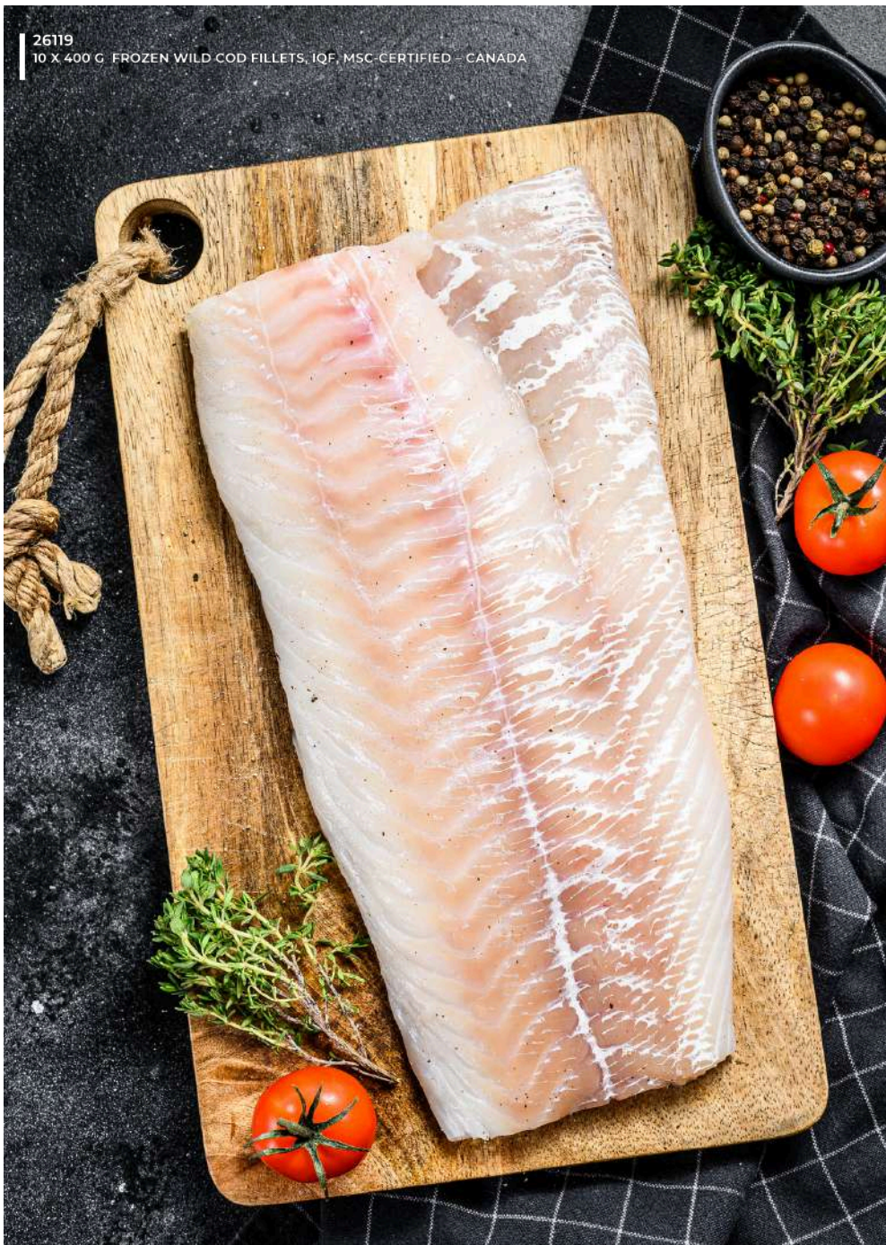
26119 10 X 400 G FROZEN WILD COD FILLETS, IQF, MSC-CERTIFIED – CANADA