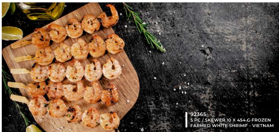
92365 5 PC / SKEWER 10 X 454 G FROZEN FARMED WHITE SHRIMP – VIETNAM