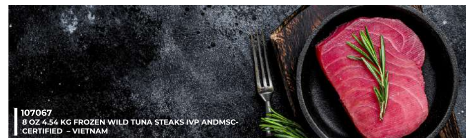
107067 8 OZ 4.54 KG FROZEN WILD TUNA STEAKS IVP AND MSC-CERTIFIED – VIETNAM