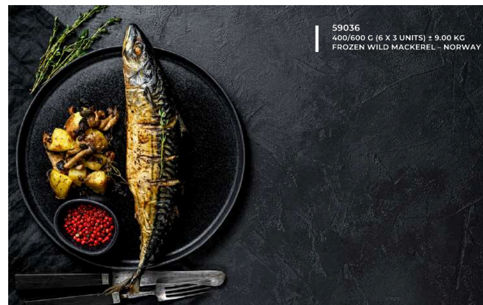
59036 400/600 G (6 X 3 UNITS) ± 9.00 KG FROZEN WILD MACKEREL – NORWAY