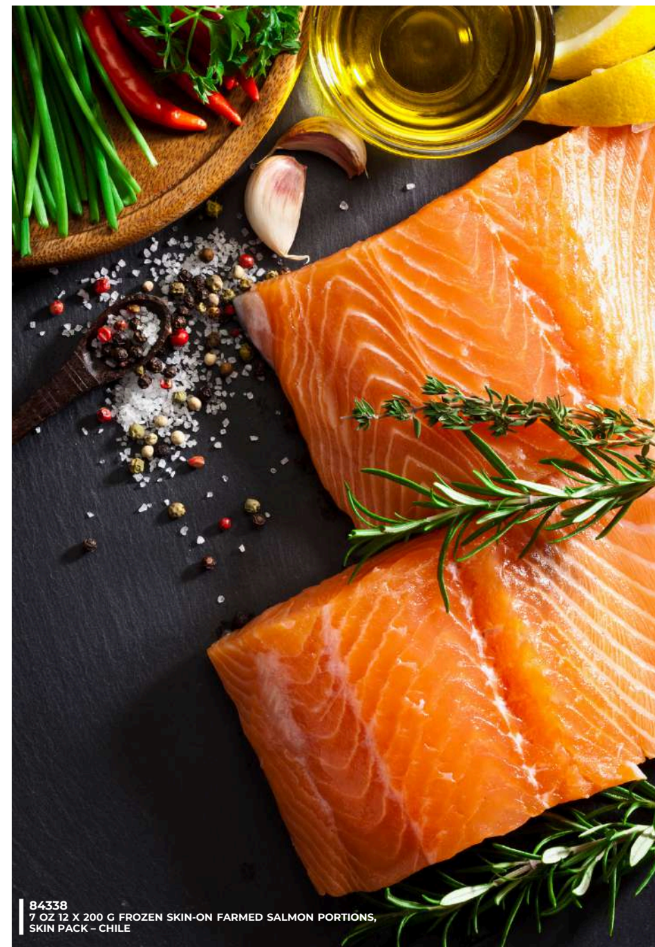
84338 7 OZ 12 X 200 G FROZEN SKIN-ON FARMED SALMON PORTIONS, SKIN PACK – CHILE

103081 7-9 oz 12 x 200 g Frozen Farmed Tilapia Fillets, Skin Pack – Colombia