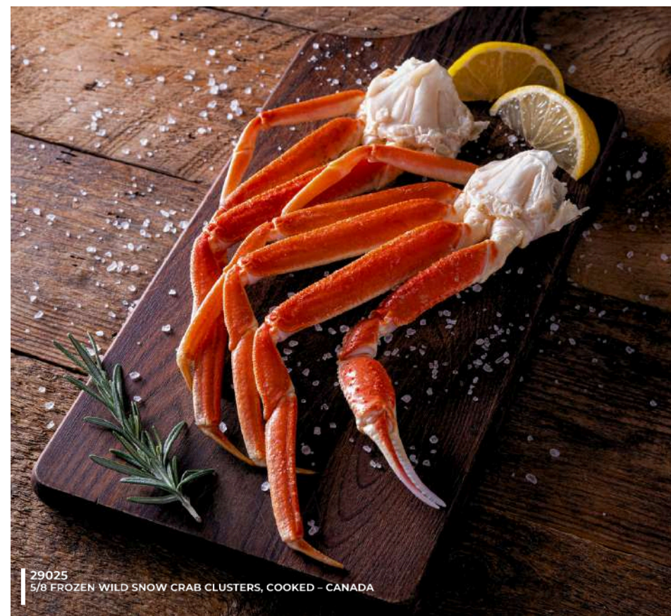
29025 5/8 FROZEN WILD SNOW CRAB CLUSTERS, COOKED – CANADA